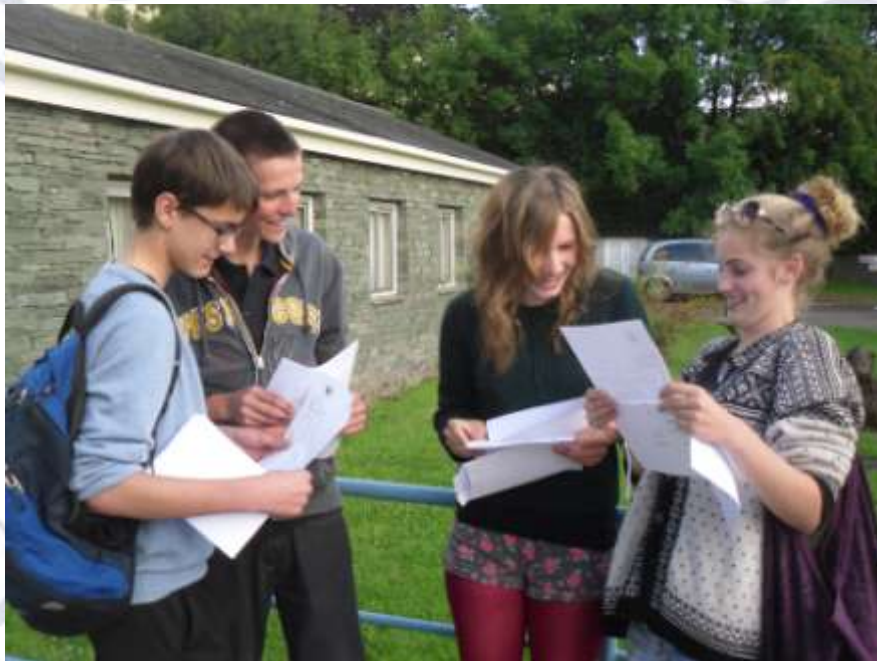
Year 11 students receiving their results 2011