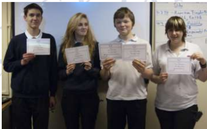
Silver and Gold Mathematics Challenge Award winners

The school facilitates early GCSE entry for able students with progression to AS level in Year 11 and has provided the opportunity for students to complete Open University modules in their interest areas. The KS4 curriculum can also be personalized to provide the challenge appropriate for Gifted and Talented students.