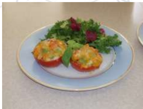
Y11 GCSE Catering Coursework

Fresh drinking water is available in school. There are three water dispensers for student use around school. Students may bring water to lessons in a clear, plastic drinking bottle.